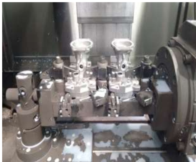
Figure 5.1 Fabricated Fixture is used in machine for Manufacturing

Using Trial and error method the fixture is fabricated and also Manufacturing process started using this Fixture.