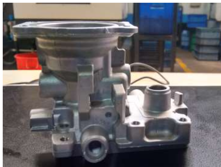
Figure 3.1 Pump Cover

Cast iron body of pump cover component which is supplied from Emmel wheelars Kolhapur.