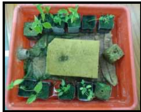
Fig:7 plant in rockwool