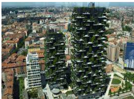
Fig:2 Bosco Vertical Side View