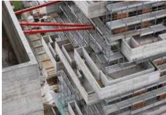
Fig:1 Bosco Vertical Balcony top view

In Bosco vertical the plants were grown in soil medium. But due to soil there will be extra load on building structure. To reduce the load from the building we were adopting Hydroponic method to grow the plants on the building.