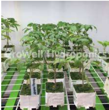
Fig:6 Rockwool as a growing medium

Growing with hydroponics comes with many advantages, the biggest of which is a greatly increased rate of growth in your plants. With the proper setup, your plants will mature up to 25% faster and produce up to 30% more than the same plants grown in soil. Your plants will grow bigger and faster because they will not have to work as hard to obtain nutrients. Even a small root system will provide the plant exactly what it needs, so the plant will focus more on growing upstairs instead of expanding the roots. All of this is possible through careful control of your nutrient solution and pH levels. A hydroponic system will also use less water than soil based plants because the system is enclosed, which results in less evaporation. Believe it or not, hydroponics is better for the environment because it reduces waste and pollution from soil runoff.