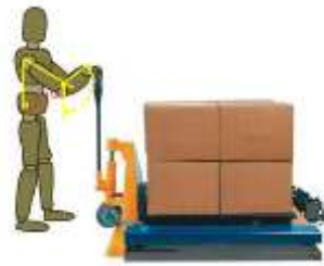
Figure 3 Proposed Improvements

3. It provides portable ladder aids to take containers that are on a rack that has a height higher than the height of the operator so that the operator's neck posture does not lift because the neck can be parallel to the tool carried. The upper arm does not form an angle above 100^\circ . The activity before the improvement has a 9; when using a portable ladder, it scores 5.