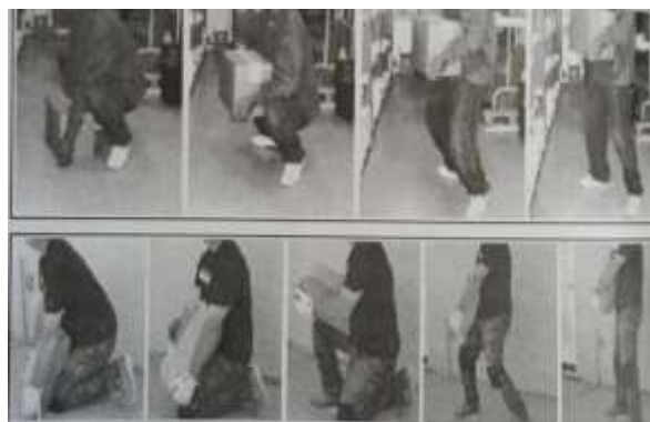
Figure 5 Illustration of placing / retrieving jewelry

4. Provide training to operators on how to obtain or install jewelry properly.