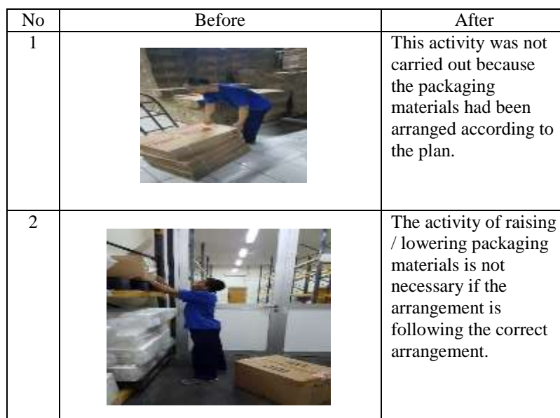
Table 5 Proposed Improvements

2. Reducing the load being pulled or pushed by using a hand pallet. This load reduction will affect the operator's posture; the posture will be more upright so that it can reduce the Flexi of the body's final shape so that the original body score of 9 becomes 5.