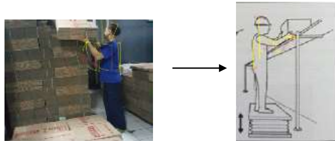
Figure 4 Proposed improvement

3. It provides portable ladder aids to take containers that are on a rack that has a height higher than the height of the operator so that the operator's neck posture does not lift because the neck can be parallel to the tool carried. The upper arm does not form an angle above 100^\circ . The activity before the improvement has a 9; when using a portable ladder, it scores 5.