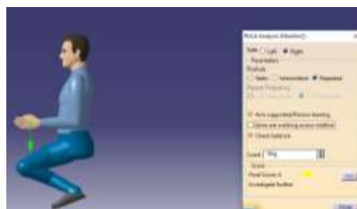
Figure 6 Illustration of placing items correctly

With an upright posture, an upright head, and bent legs will reduce the level of risk, as illustrated by using Catia in figure 6