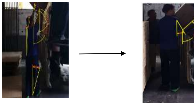
Figure 7 Proposed Improvements

5. Providing space by ordering goods twice delivery because the truck is too full, and there is no space for the operator to carry out activities. Provision of this space to put the sample from the truck that is taken out by the operator to be placed on a pallet, thereby reducing the activity to reach by the operator. Initial body score from 9 to 5.