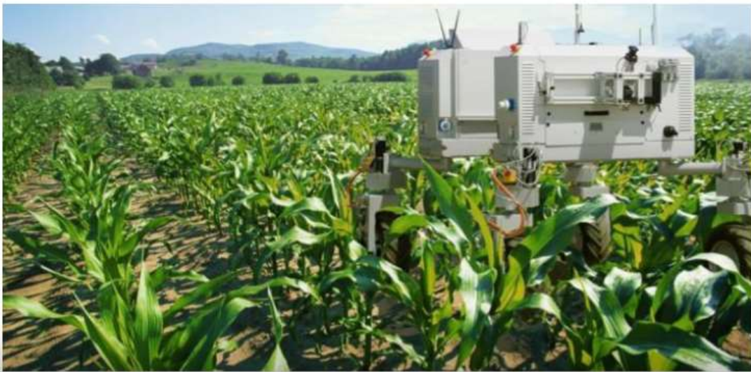
Figure 3 Use of robots in agriculture [10].